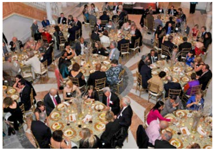
Guests at the 70th Anniversary Gala will enjoy a seated meal in the beautiful National Women's Museum, just as they did at the 65th Gala.

On March 5, The Barker Adoption Foundation celebrates its 70th anniversary with a grand gala featuring prestigious guest speakers, fantastic silent